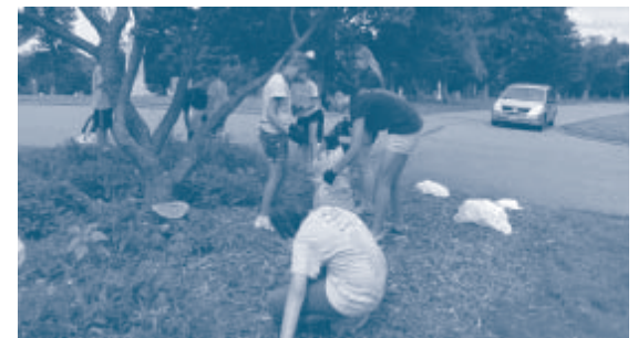
Youth from Church of St. John Neumann in Eagan did weeding and other tasks at Resurrection Cemetery last summer.

The staff is looking forward to having these wonderful young people and their counselors with them again on June 21, July 5, July 19 and July 26. Stop by one of those mornings and see their faith in action.