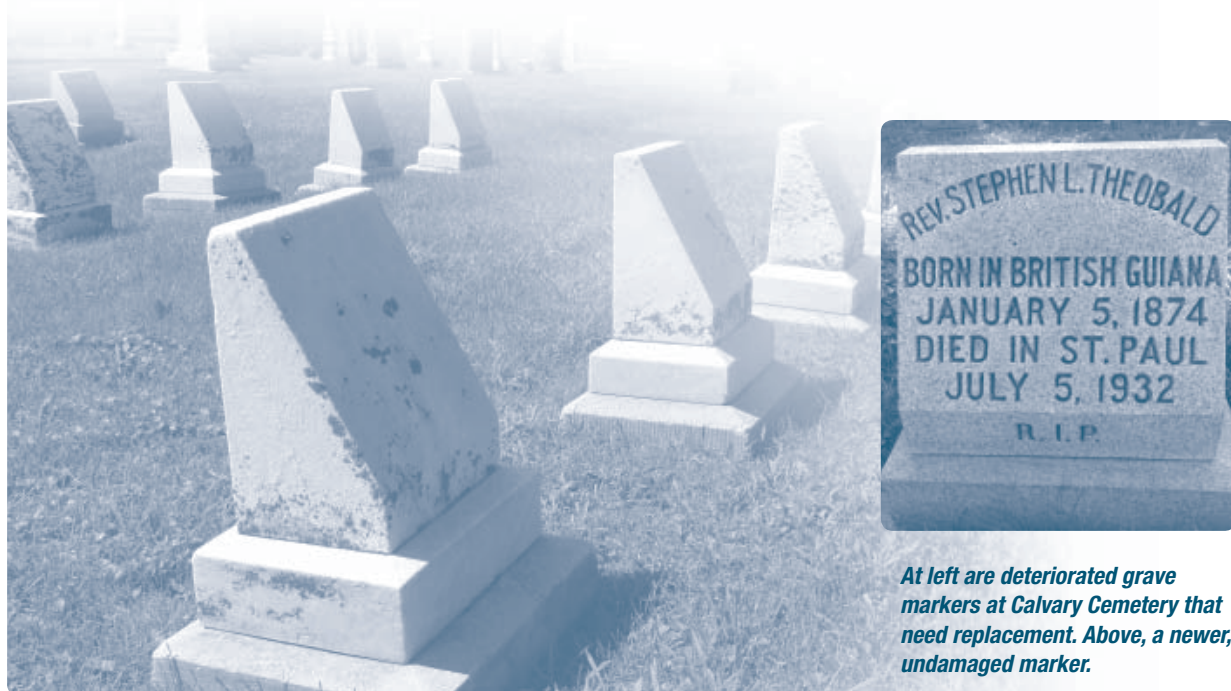
At left are deteriorated grave markers at Calvary Cemetery that need replacement. Above, a newer, undamaged marker.

In addition to parishes, the University of Saint Thomas adopted two markers in honor of past university presidents. Donations have also been received from Knights of Columbus Councils in Minneapolis and Burnsville, and through a free-will offering by attendees at last year’s Memorial Day observances.