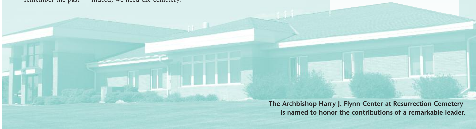
The Archbishop Harry J. Flynn Center at Resurrection Cemetery is named to honor the contributions of a remarkable leader.

Please turn to page 2 to learn about another way The Catholic Cemeteries is honoring the Archbishop.